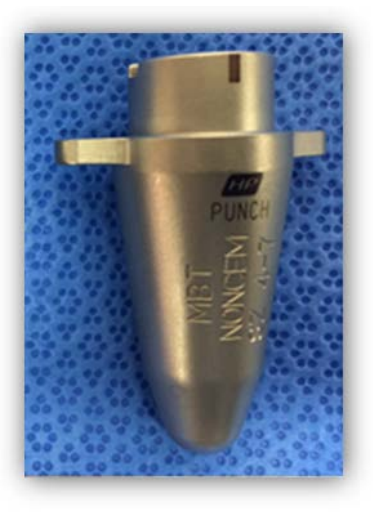
Figure 1: Image of SIGMA HP MBT Non-Keel Punch Knee Instrument

The HP MBT Non-Keel Punch is designed to be used as an option in stabilizing the tibial trial during trial reduction.