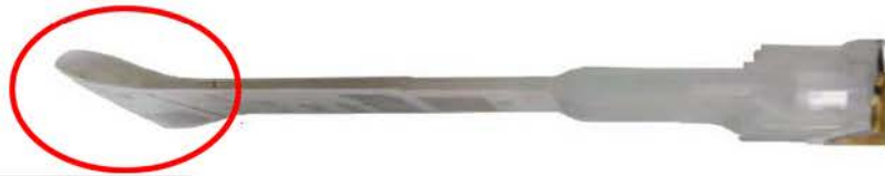
Incorrectly applied label