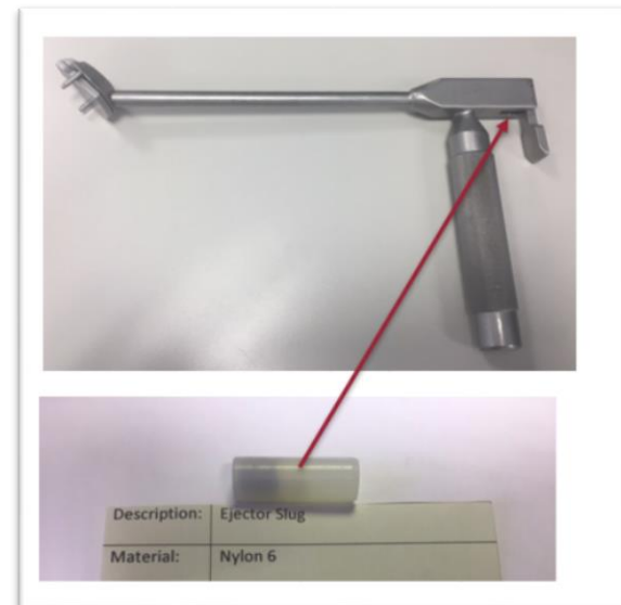
Figure 1: Images of ACETABULAR CUP INTRODUCER (32mm) and Nylon 6 Slug

The cemented cup introducer is used to insert Cemented Cups e.g. Marathon. The nylon slug component allows the introducer to be removed from the cup when it is in the correct location.