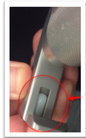
Figure 2: Image of melted slug

This recall notice is provided to medical facilities and surgeons that may have received, purchased, or used the affected ACETABULAR CUP INTRODUCER (32mm). The purpose of this instrument recall is to remove the affected instruments and to notify medical professionals of the possible effects of using the affected instruments.